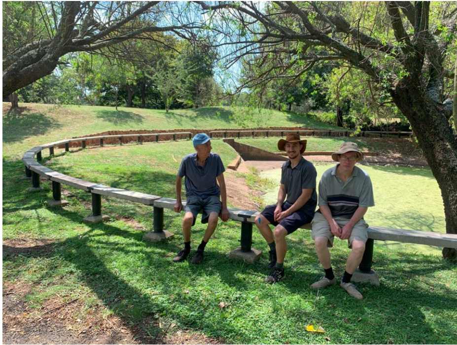
The curve builders! A well deserved rest after installing all the brackets on the curve in this picture, and beyond!