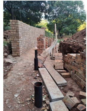
The RT tunnel under construction by the Centurion Society of Civil Engineers.

Below some/plenty of sleepers, and brackets being painted.