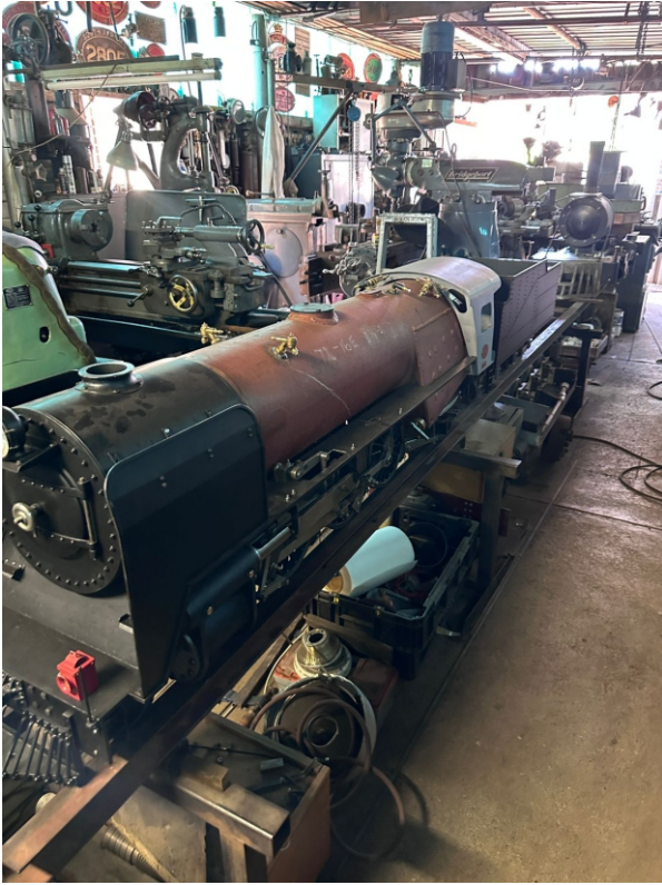
Charles Viljoen's 16E, originally a 5 inch design, modified for 7 1/4 inch track.