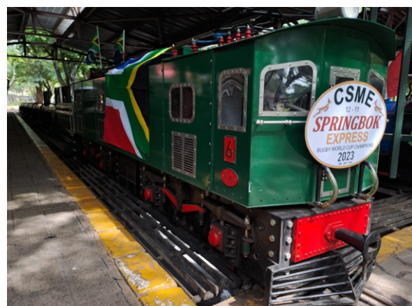
Guest appearance by the CSME SPRINGBOK EXPRESS