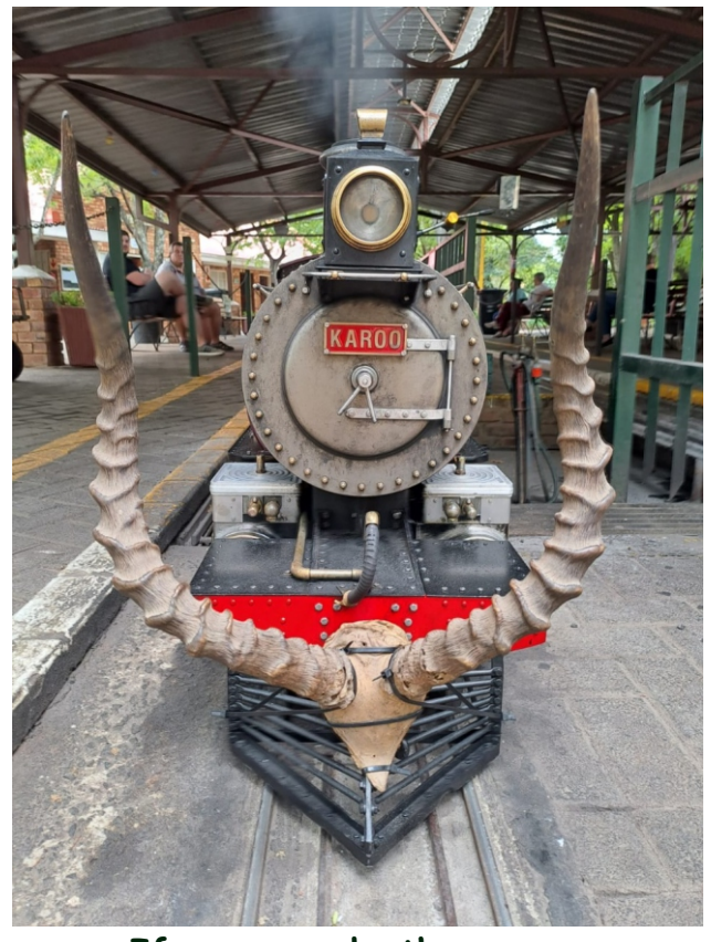
If anyone ask, these are Springbok horns!