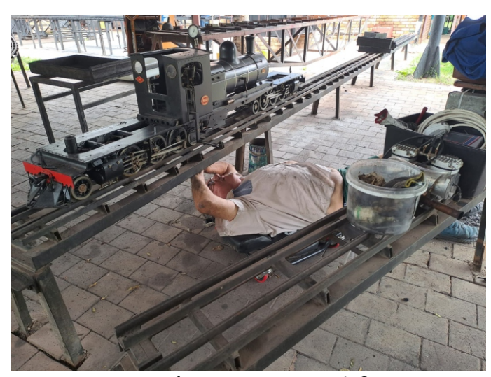
Steam bay or steam pit? Steam bay AND steam pit!