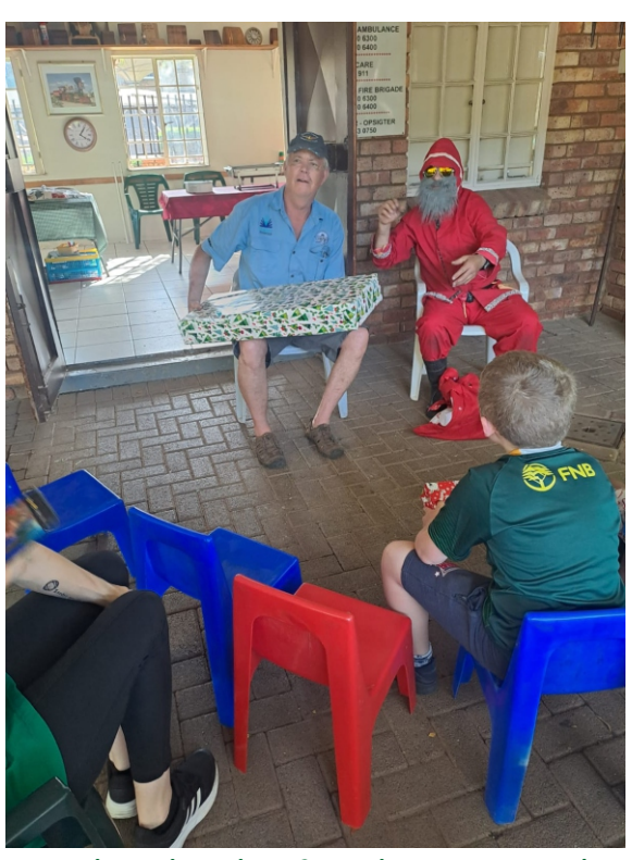
I thought the Grinch was green!