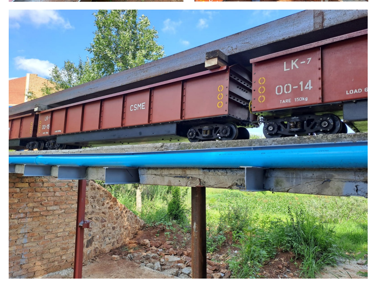
Registered as a Non-profit organization in terms of Act 71 of 1997, Registration No. 275-273 NPO