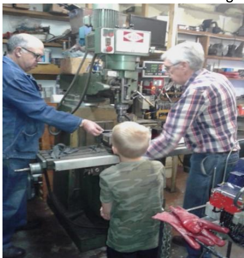
Drilling the parts for PMB engines.