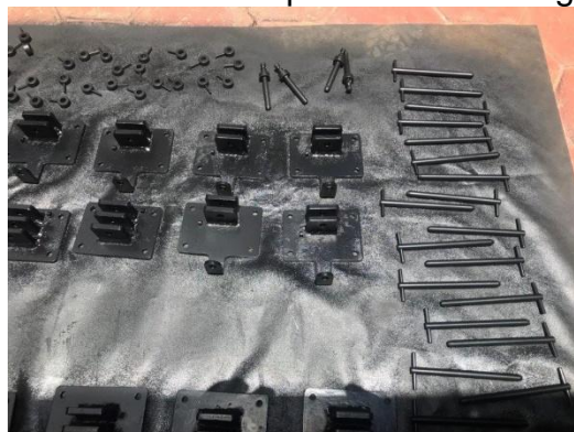
New couplings for rolling stock