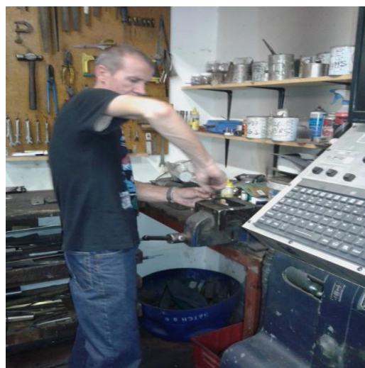
Tapping the holes.