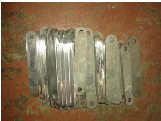
New coupling links for finishing.

The club has profiled a set of new couplers as well as links. A few special links were also cut that have smaller holes to cater for members that have different size pins on their riding cars.