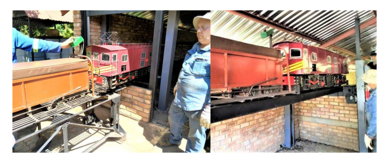
Checking this week's work to make sure no snags with locos going into the new storage area.