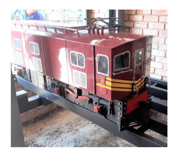
On she goes!