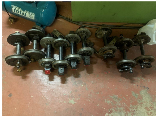
Invasion of the wheels - stripped out by the Tuesday gang for some love and care.