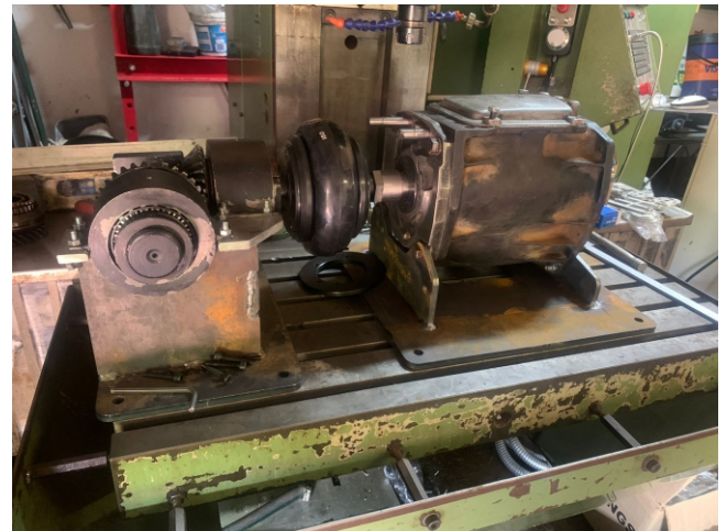
Drive train for petrol loco rebuild by the Tuesday gang.