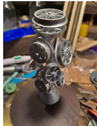
Garden railway wheels cast in zinc with the 'lost wax' casting technique by Carel Janse van Rensburg.