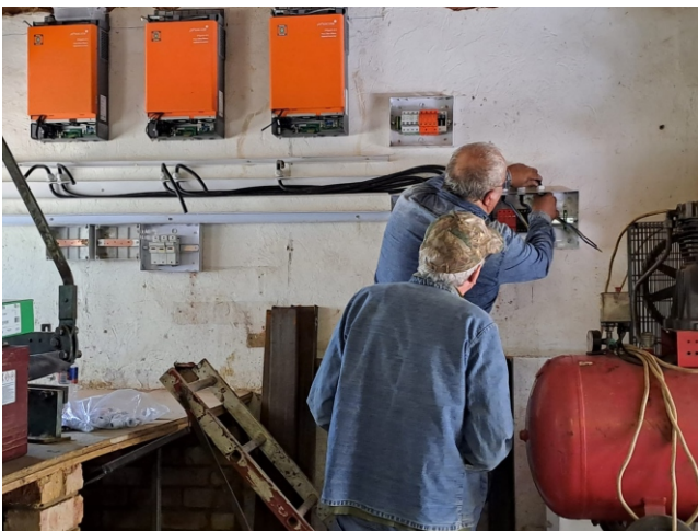
Model Engineers at work: Installation of the CSME solar system.