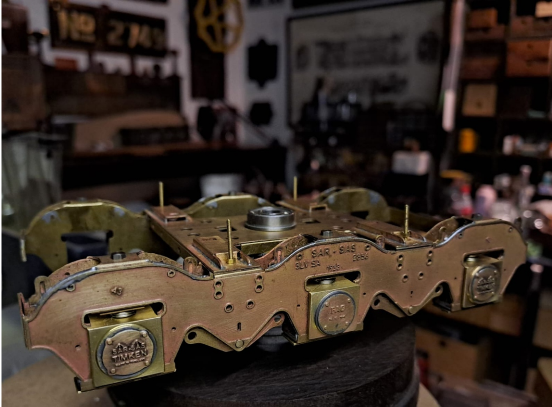
The CAPE GAUGE 1, 1:24 scale EW tender bogie now mounted with spring loaded axle boxes by Carel Janse van Rensburg.