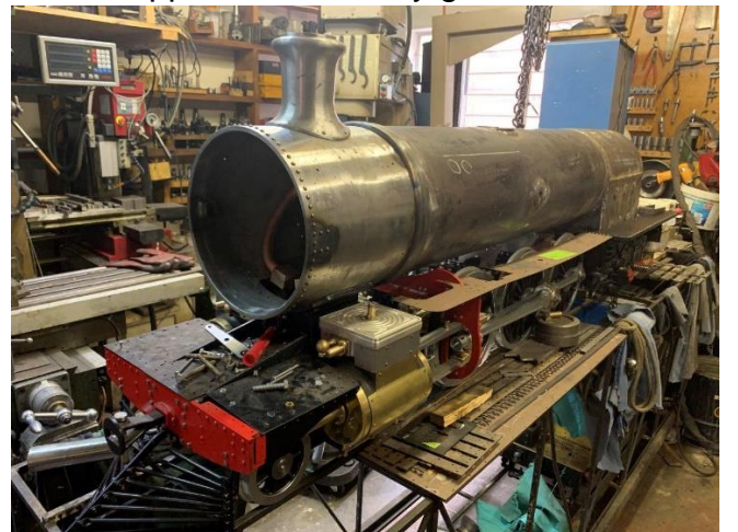
<u>Leon's 5 class progress,</u>

It would appear that nobody goes near the workshop as the only updates I receive are from Leon.