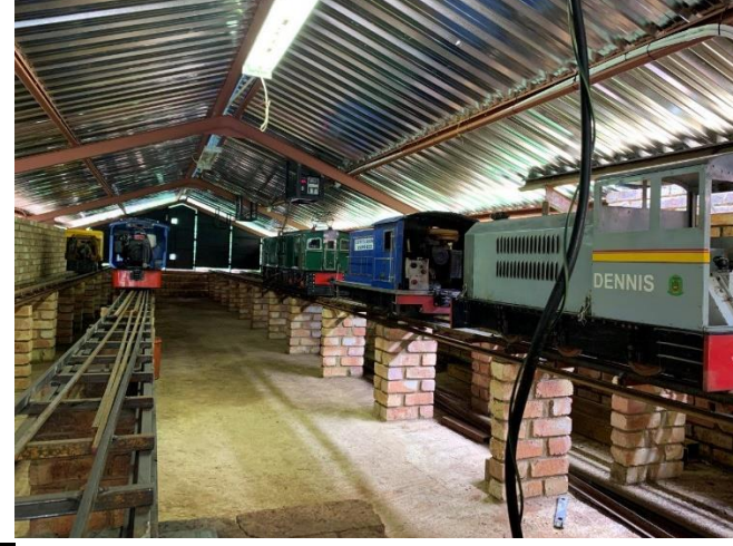
He spent many hours on this also