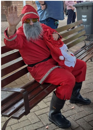
CSME's very own Father Christmas