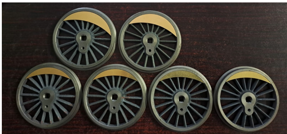
Carel Janse van Renburg's CNC router machined "cosmetic" counter weights for Attie's 10mm to the foot, gauge 1, Green Arrow loco build.