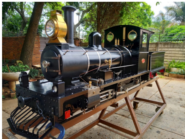
Charles Viljoen just finished another stunning 7 1/4 inch LAWLEY!