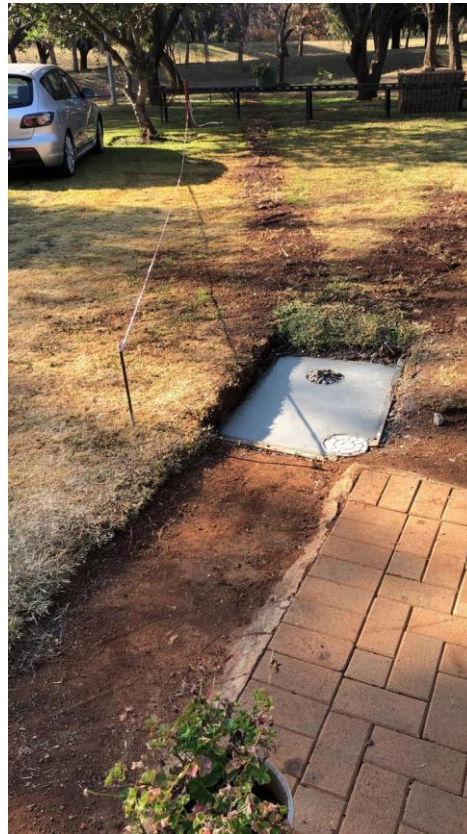
New drainage in the unloading area