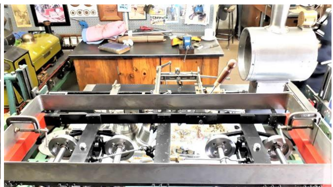
Progress on the Popich American switcher