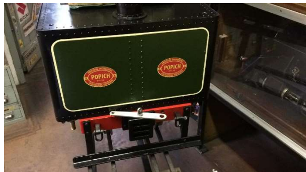
Photos of Nic Popich's switcher tender courtesy Roko Popich and Leon Kamffer.