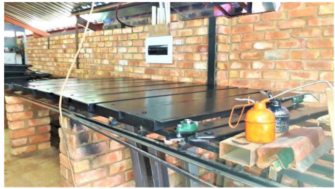
New riding car parts – assembly already started!