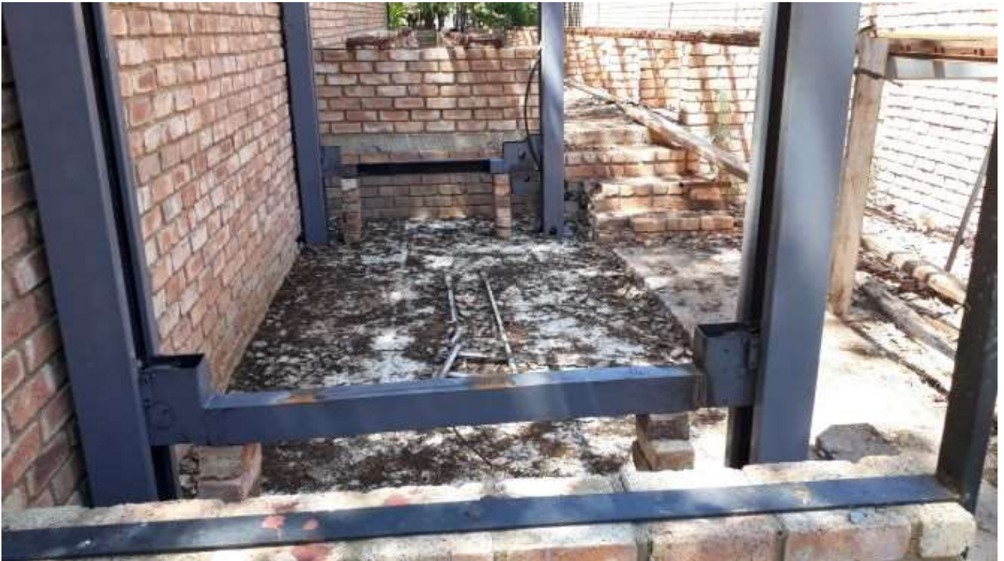
Repurposed car lift altered to raise locos from steaming bay line to the storage line height