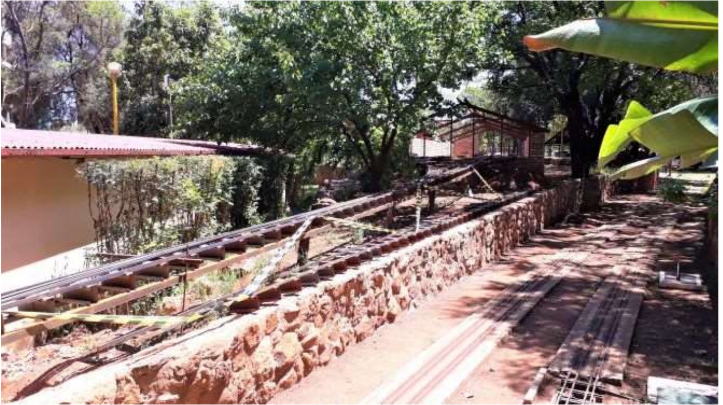
Track from the new storage to the station line.