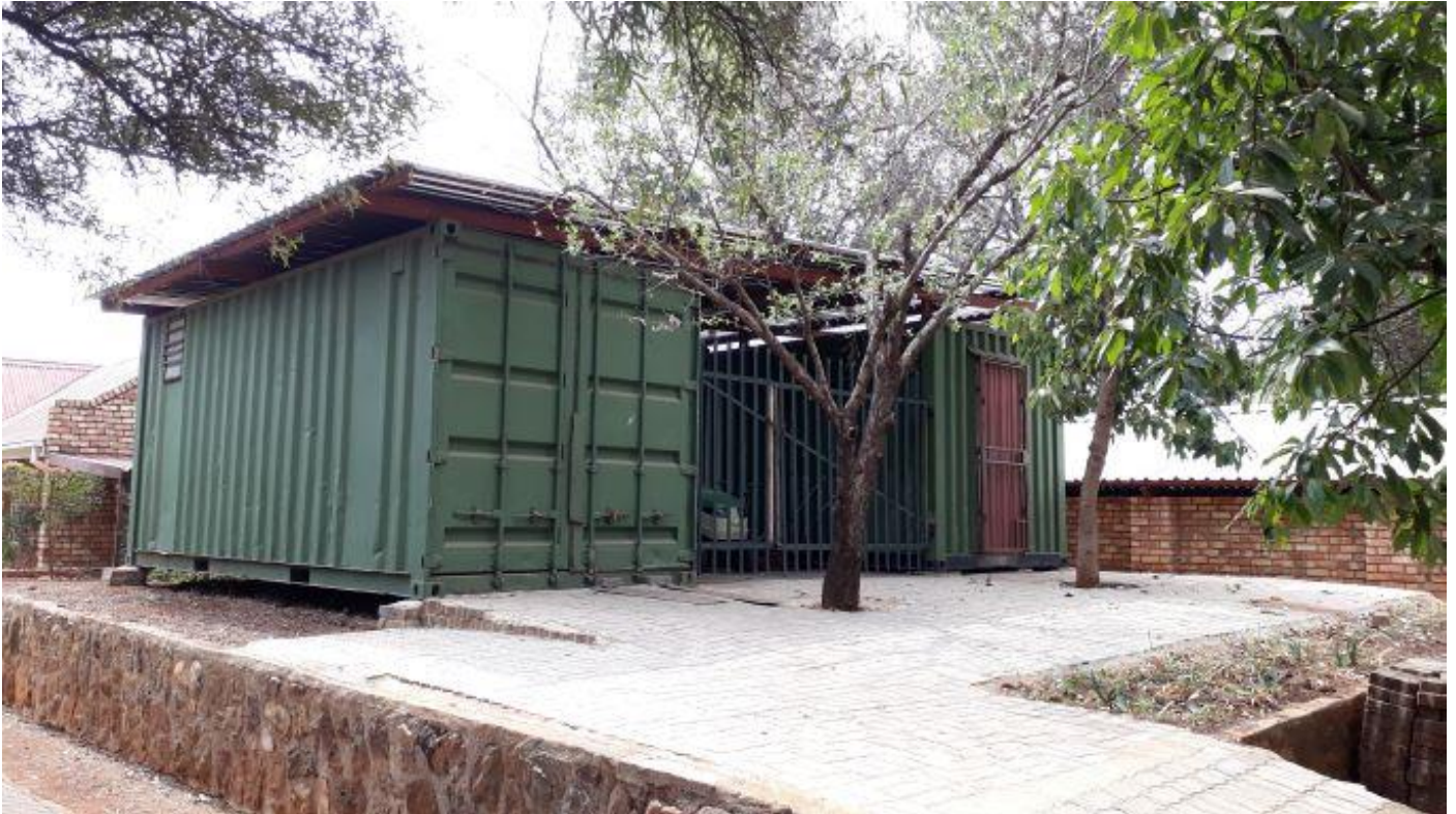
Containers & lawnmower storage

Links between the DZ trucks have been fitted and secured to the rear coupling of each truck, so hunting for links should be a thing of the past!