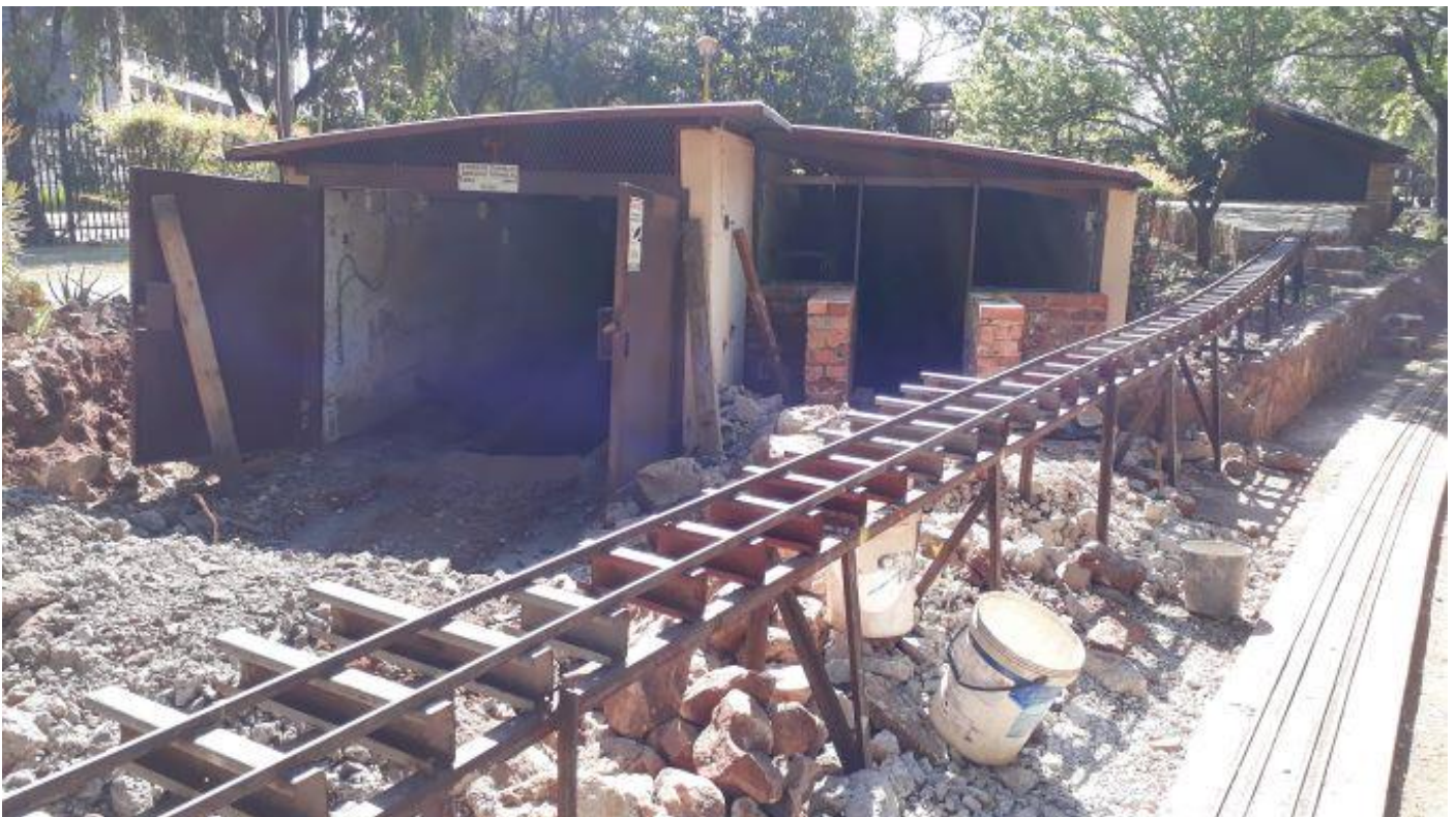
Work on the old carriage storage to raise the tracks above historic flood levels