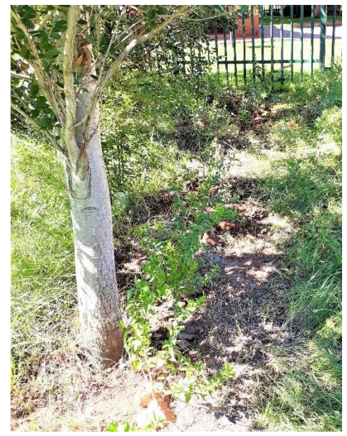
Earlier plantings progressing well