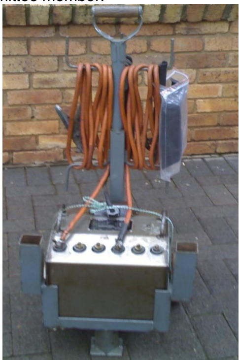
Welder with trolley and accessories