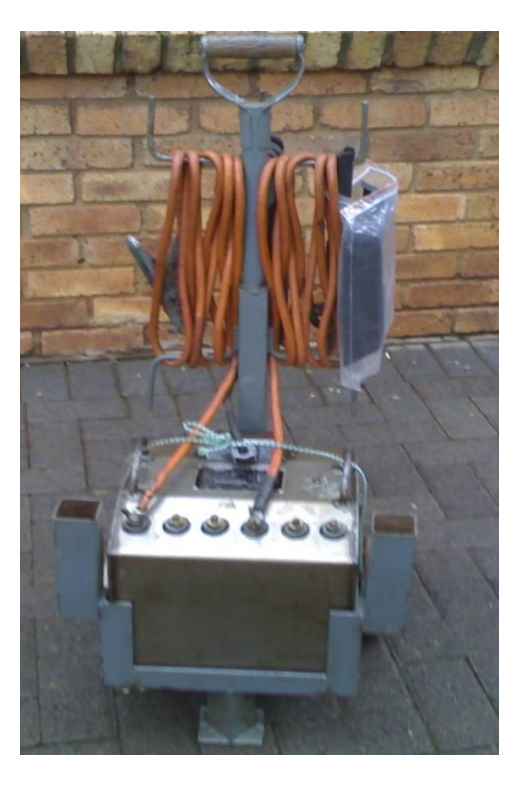
Welder with trolley and accessories