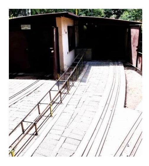
Dare I say we now have a raised track!

The recent rain had softened the ground along the tree line parallel to the long length of track descending from the horseshoe level to ease the task of digging holes to plant the Keiapple bushes. Later hot weather has hardened the ground again and wilted some of the planted saplings. Rain over the new year period should help with the plant growth and hole digging. Planting of the keiapples is slow, Mondays only, due to staff pressure. Some of the other bushes that looked almost dead have now perked up. We have a couple of dead trees to be cut down and replaced as well as others to be trimmed as Monday gang time permits.