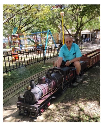
Engines on the CSME track in April - May 2023