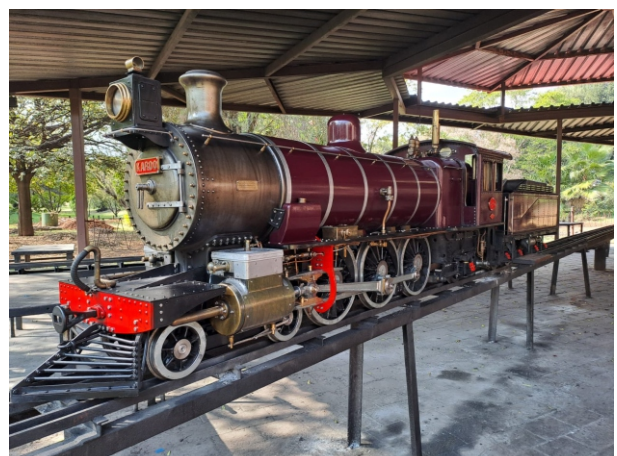
Engines (and rolling stock) on the CSME track in April - May 2023