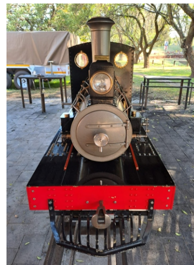
Engines on the CSME track in April - May 2023, And LADY SHAY got her name.

Registered as a Non-profit organization in terms of Act 71 of 1997, Registration No. 275-273 NPO