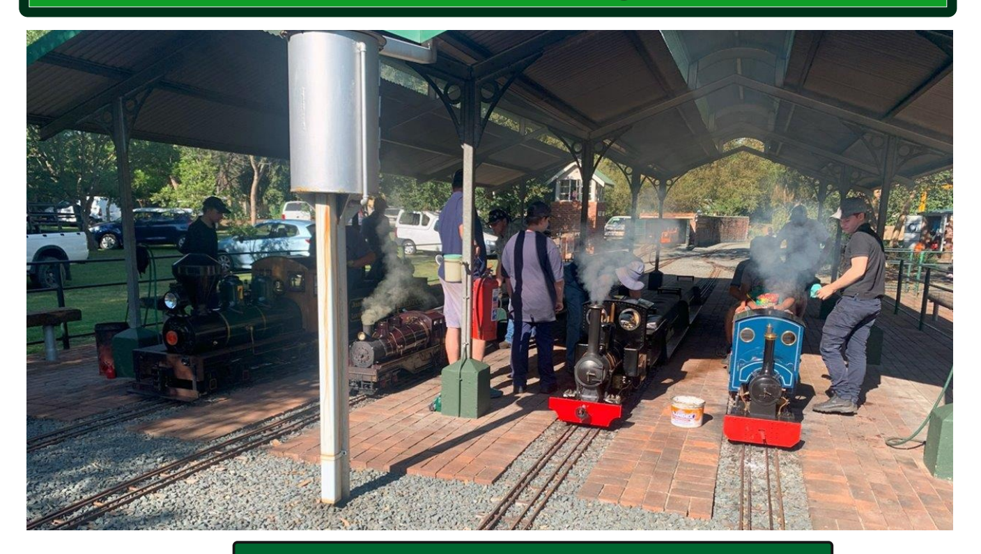
Now that is how a steam meet station should look like!