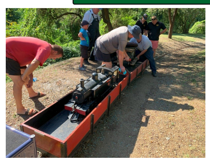
Breakdown train after a crosshead pin fell out.