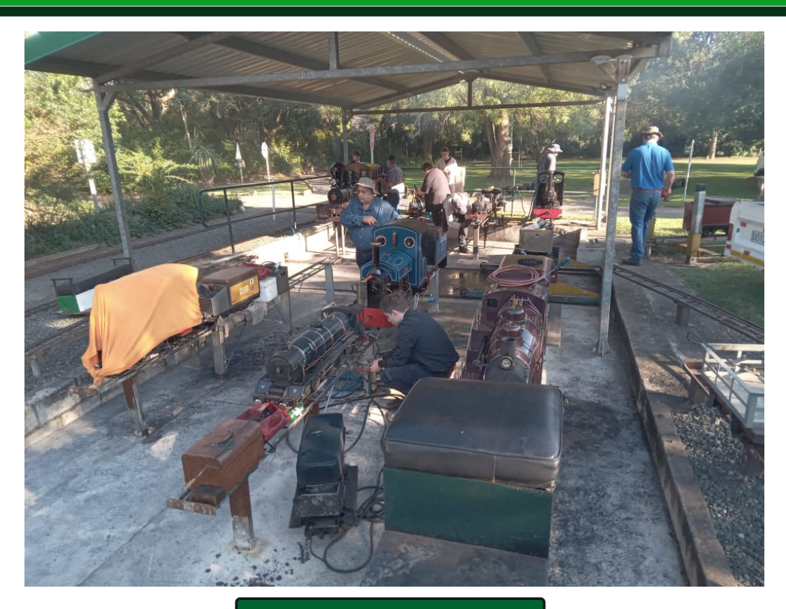
A busy PMES steam bay.