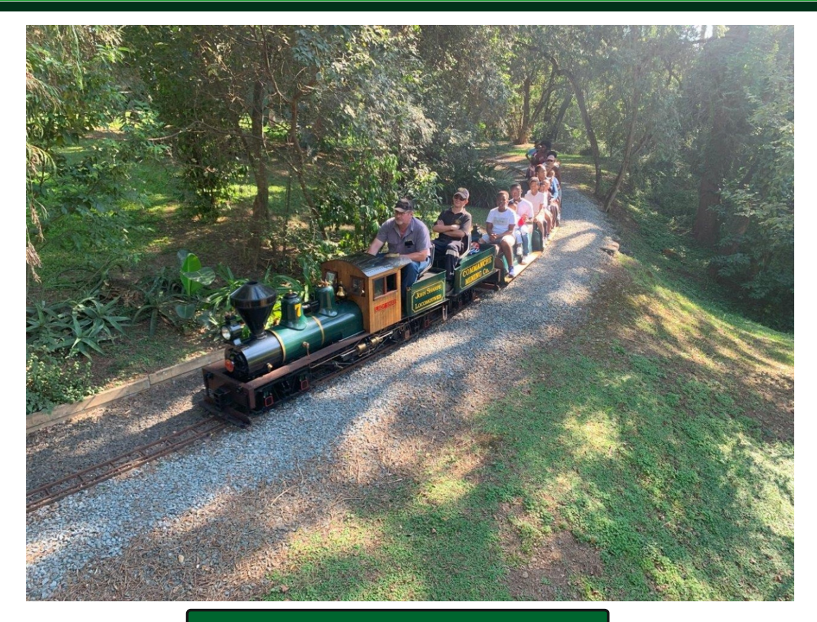
Out on the track.