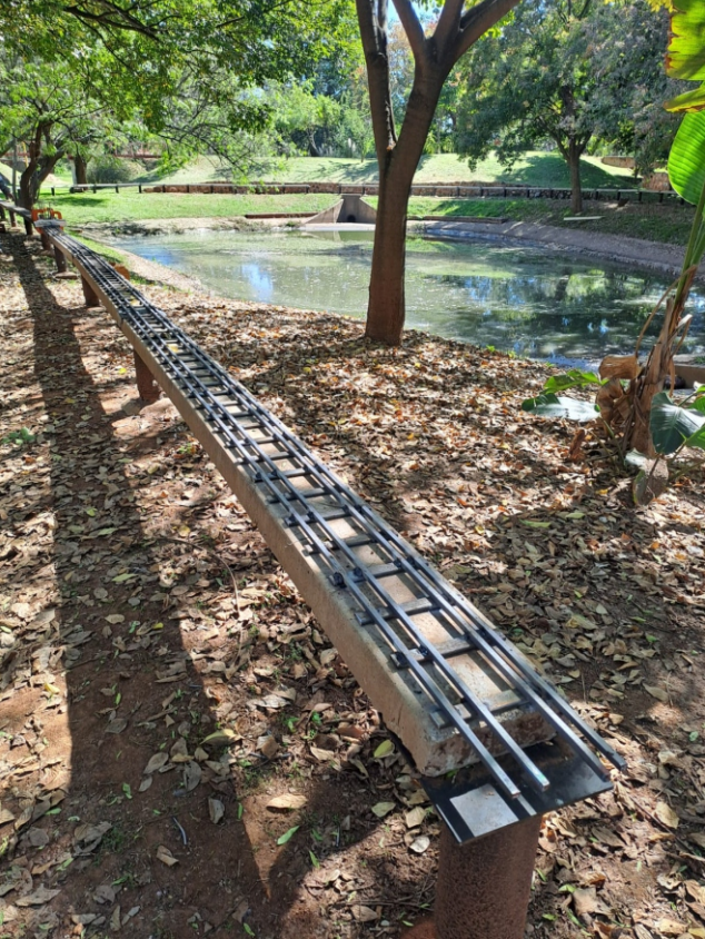
Registered as a Non-profit organization in terms of Act 71 of 1997, Registration No. 275-273 NPO