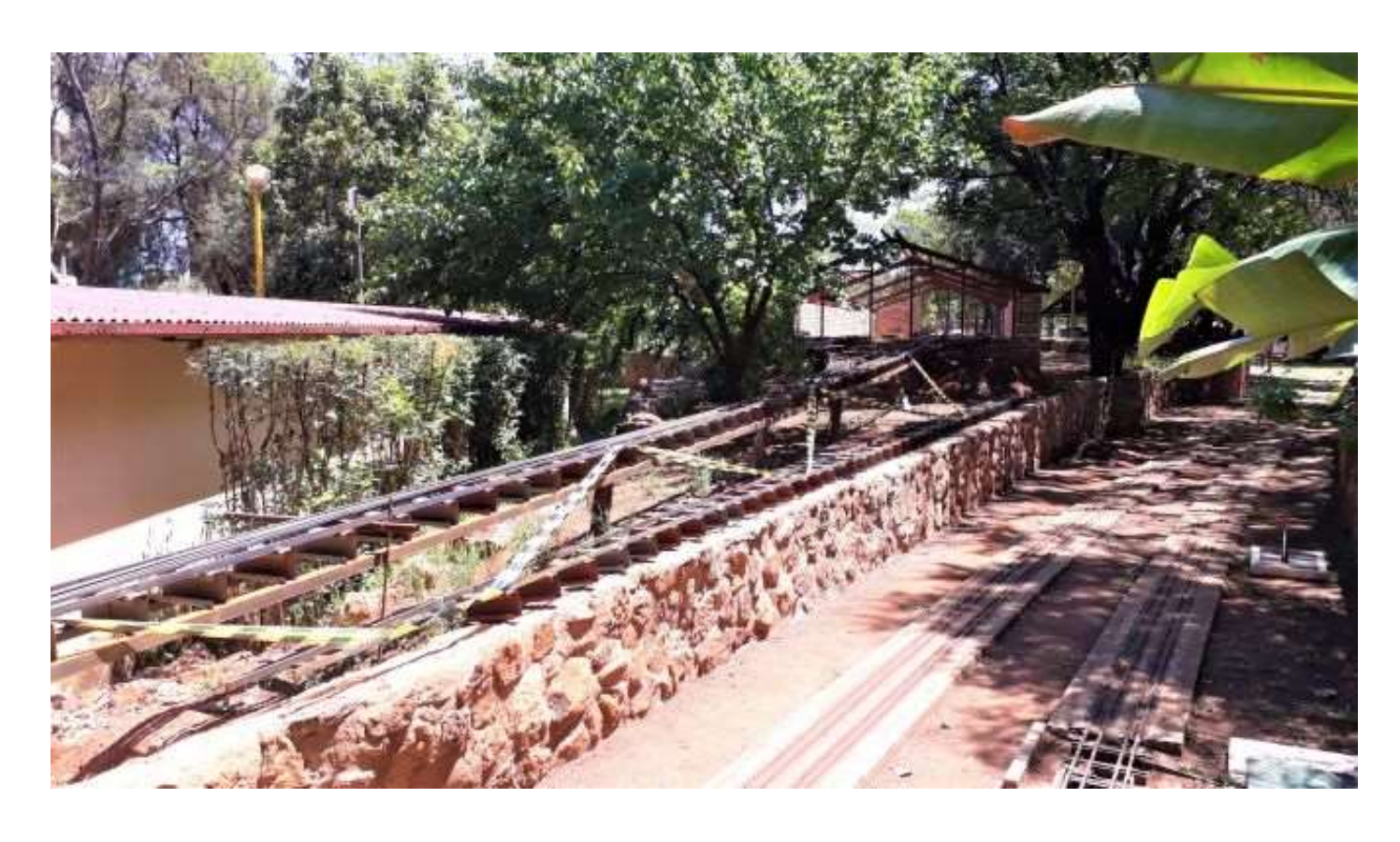
Track from the new storage to the station line.