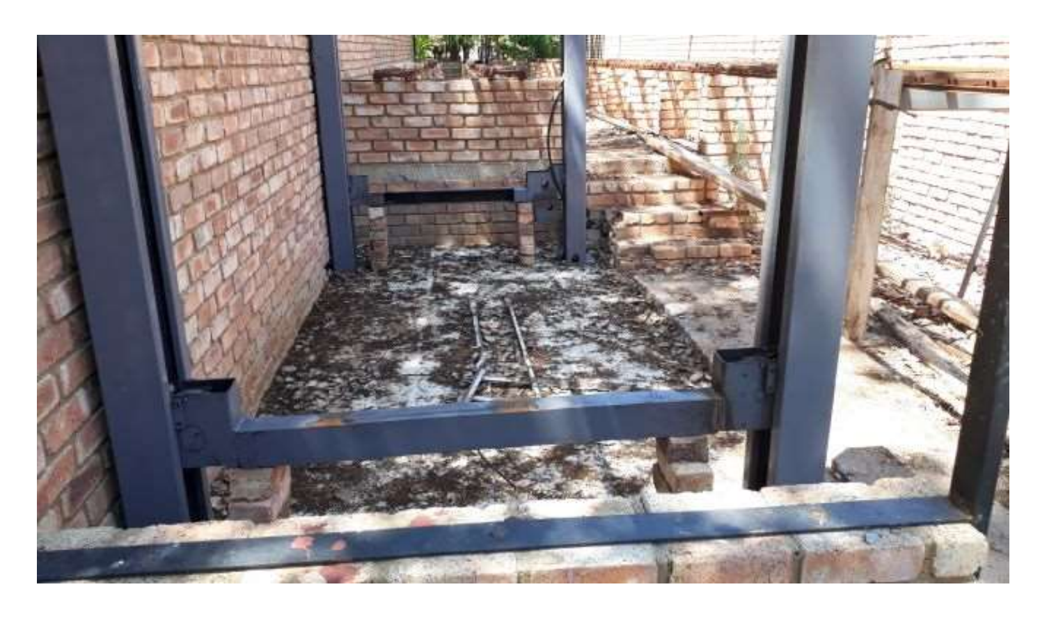
Repurposed car lift altered to raise locos from steaming bay line to the storage line height