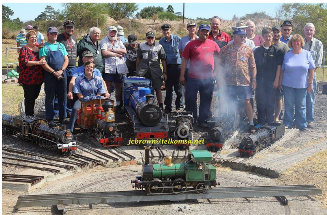
The national steam meet 2017 attendees at Western Province.