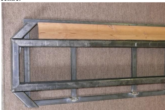
Early stages of the riding frame.

The picture below shows the early beginnings of the frame with running boards. The seat will run lengthwise down the centre.