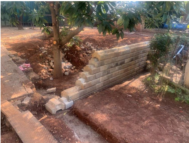
Ground raised for container