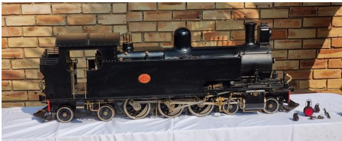
SAR "J" class