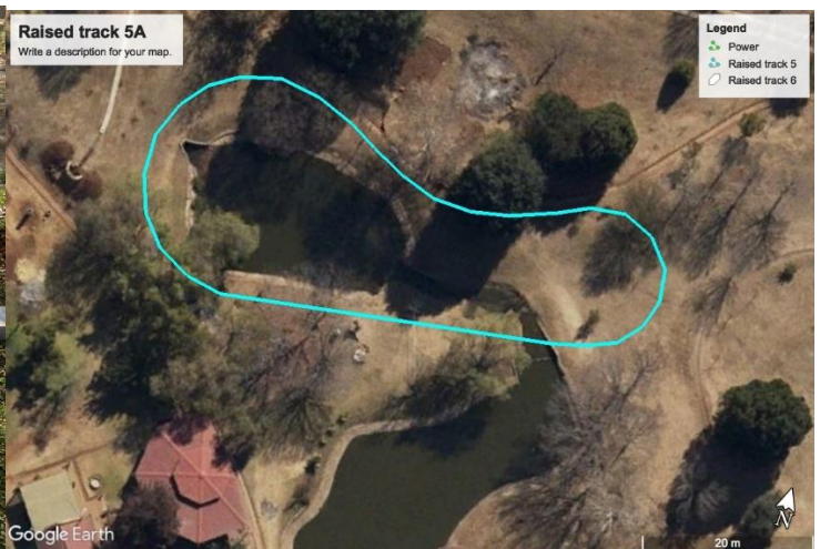
Raised track route around the lower dam

From the above photos can be seen a lot of work going on for improvements. Next month should show quite a lot of progress on these projects.