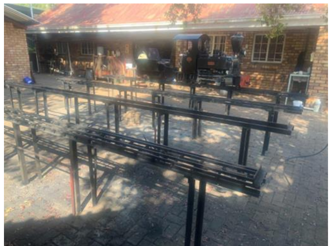
paved steaming bay