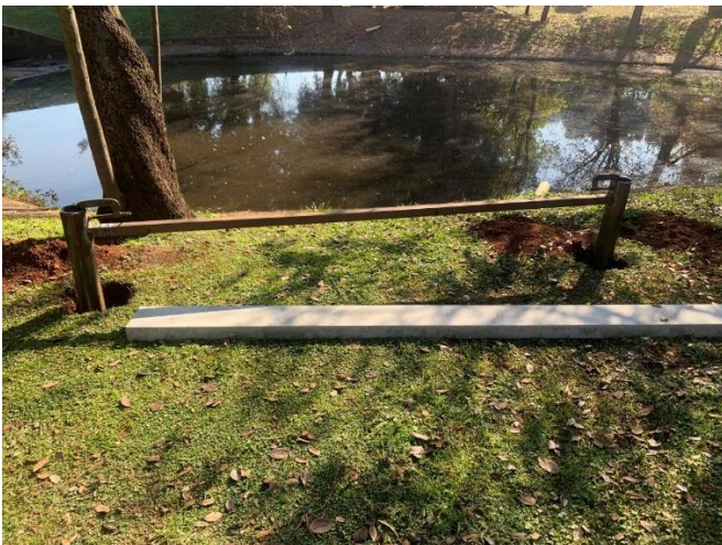
Start of raised track showing track supports.