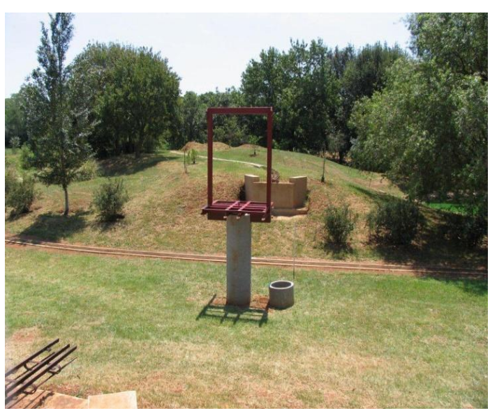
mounted and ready for next pieces