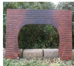
Side panel for the Fountains Valley bridge to be cast out of cement.