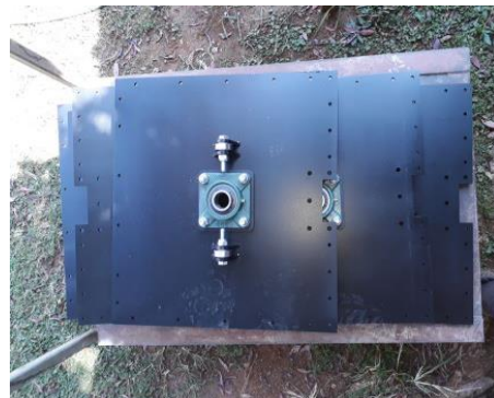
bogie swivel plates