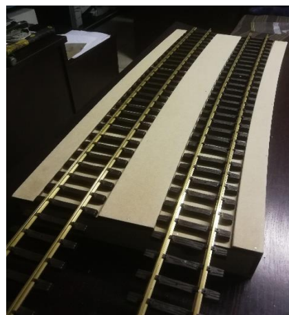
Curved road bed master to be cast out of cement.