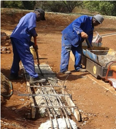
Finishing the last bit of concrete.