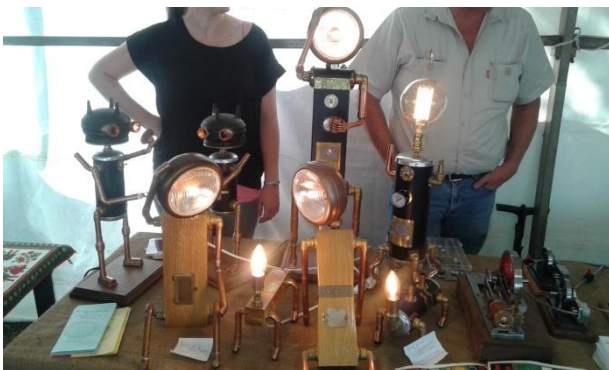
Some very unusual lamps