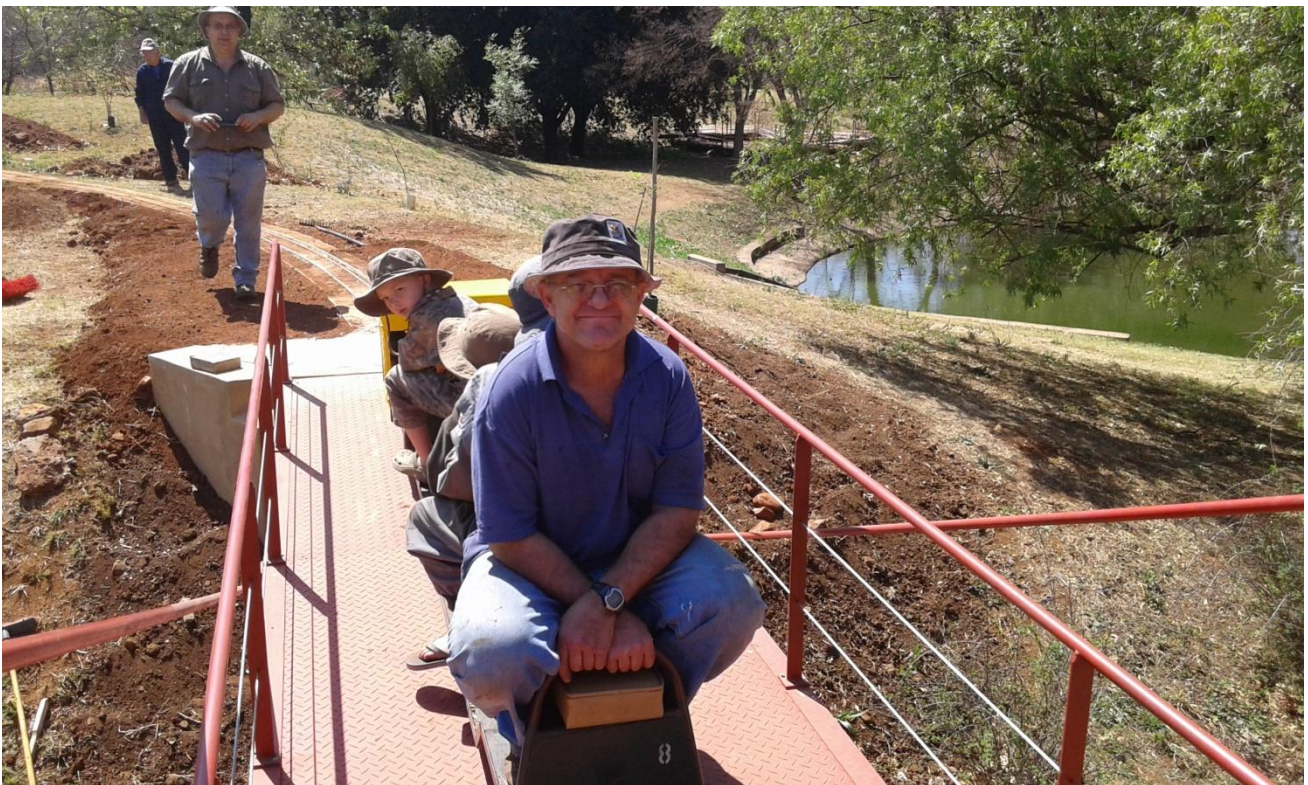
Roko looks a happy chappie!