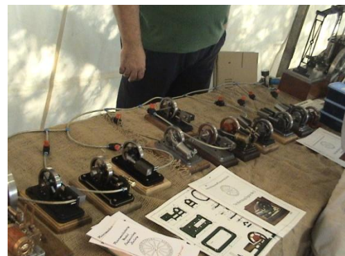
a row of PMES steam engines