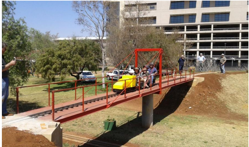
The first train around the complete track